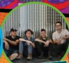
VIPER CREEK BAND